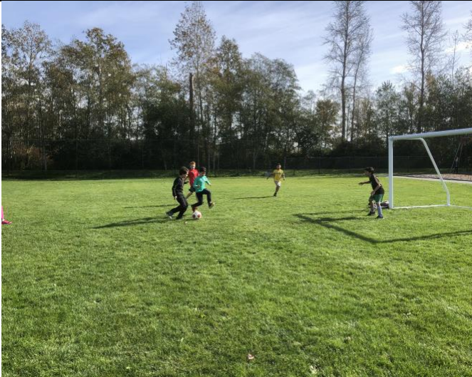
Playing soccer with friends

Halloween tips: http://www.bccdc.ca/health-info/diseases-conditions/covid-19/social-interactions/halloween