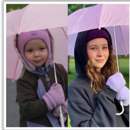
Grace then/now ☺