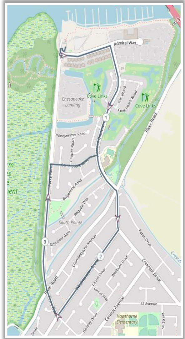
June 17 th Parade Route

Friday, June 19 th will be the final day of online and in-class instruction. Thank you to everyone for rising to the challenge of online learning from home, then part-time-in-class/online as we figured out how to continue learning during the pandemic. It's been a roller coaster! We even managed to have some fun along the way and we hope you enjoyed our Fun Fridays.